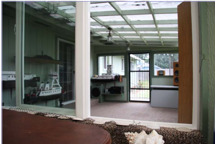
Beautiful, fully-enclosed spacious deck

Giant back yard will be outfitted with a Croquet set, or you can move your table and chairs outdoors and dine