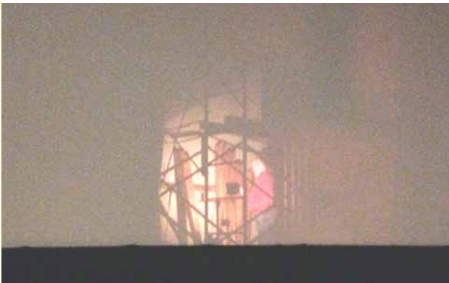
Ghostly view of Rob Kingdom through the theatre's screen