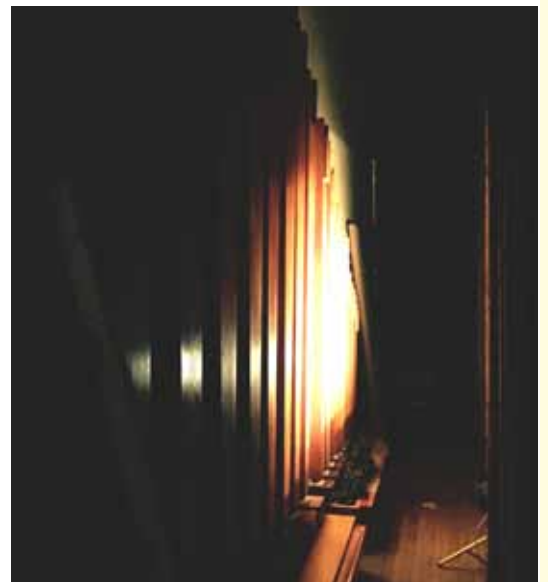
18 Diaphones mounted and awaiting wind